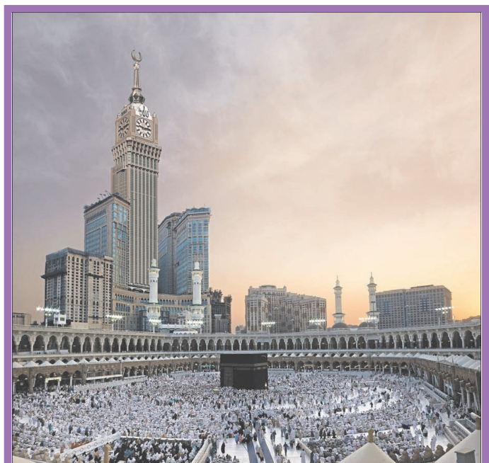
The Clock Tower looms over the Kaaba in Haram Shareef seen in the foreground

(Weary of columned marbles, sickened is my sight Raise for me another temple, build it with mud,)