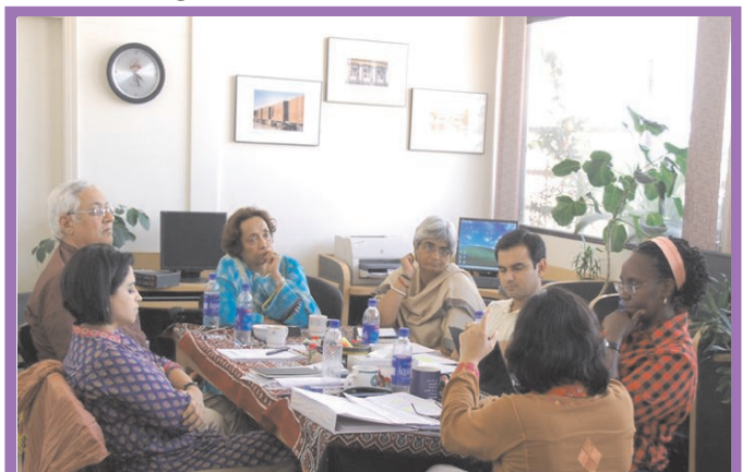
MBE Class of 2013 and faculty engrossed in a seminar on public health ethics

The classes are interactive and very busy. Students are evaluated on participation in addition to written assignments. I have struggled to keep up with the reading and keeping the subjects from getting jumbled up, while my classmates seem to easily quote sentences from the readings and authors. That part of my brain seems to have fossilized; I have been living on deduction Continued on page 6